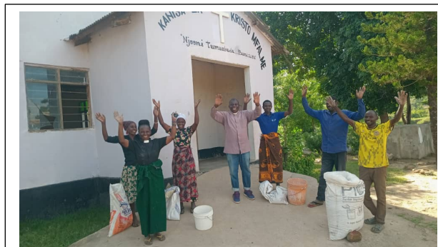
Just one of many photos of Servants of God across Mpwapwa receiving maize flour