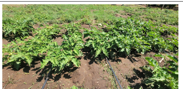
Crops at Queen Esther's using drip irrigation and water from their new borehole

The next priority of QE is to install a fence around the new dormitory block. A fence is a government requirement and will also give confidence to prospective parents that their children will be safe. Please pray for Monica, Headteacher, and all at QE. Work has started with the funds we've already sent over – donations welcome towards the £4,000 still needed to complete the project.